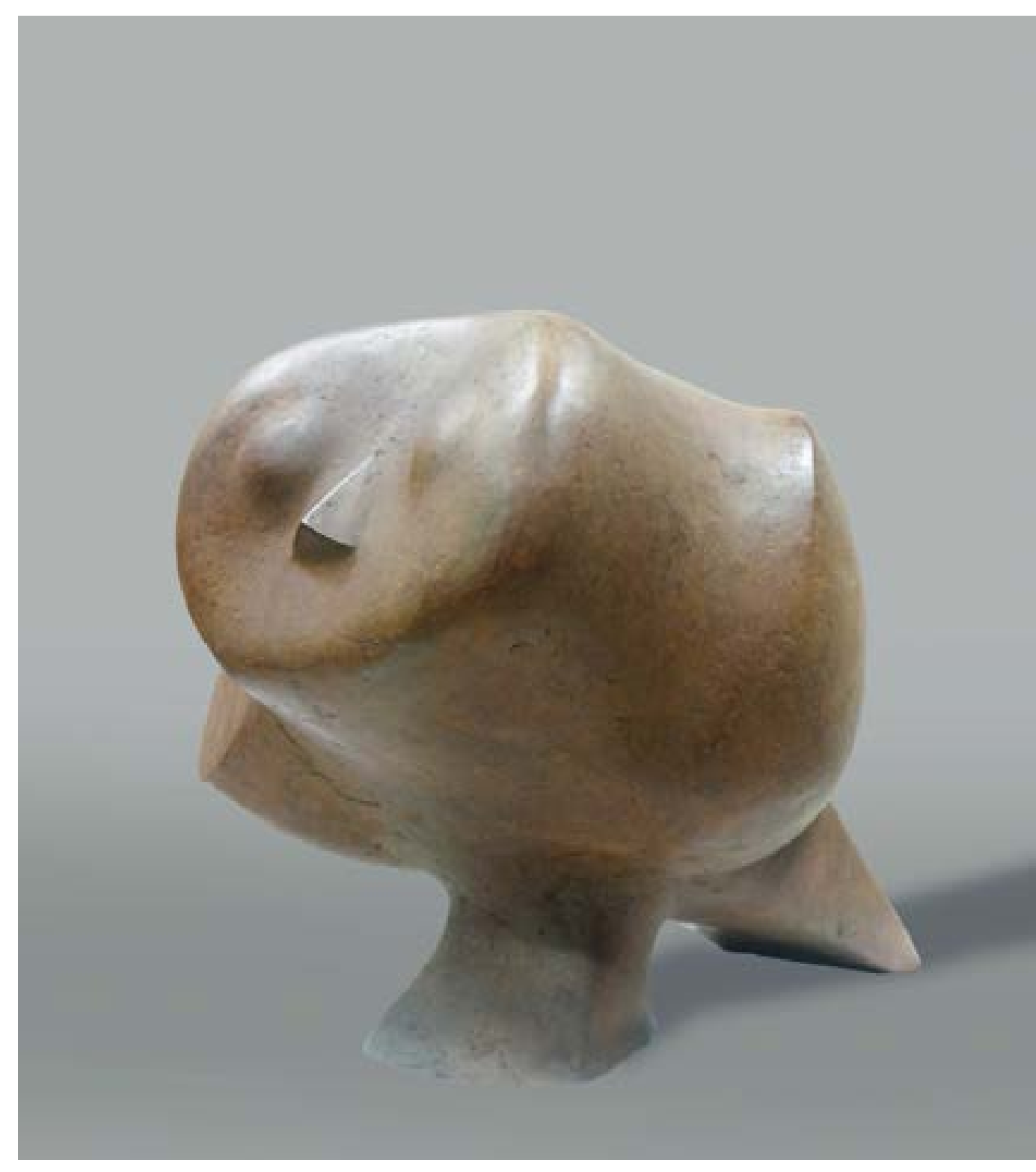
The Standing Owl, Nouba 1961, bronze, edition of 8, 47x22x45cm. Courtesy of the artist.

Bilad al-Sawad, 1993. Charcoal on paper, 9 drawings each 65 x 50 cm. Private collection.