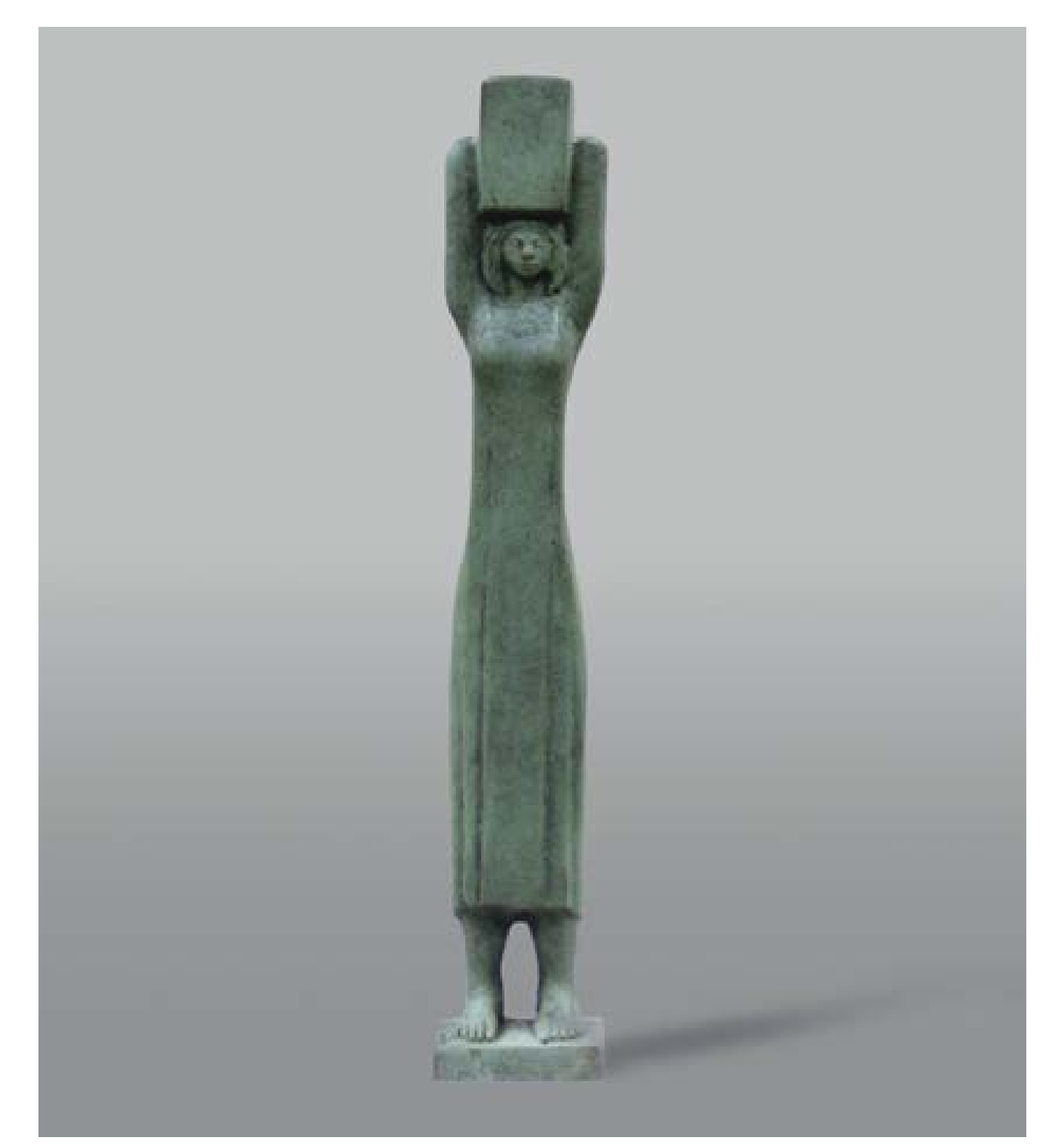
The Tin Holder, Cairo 1952, bronze, edition of 8, 61x10.5x7cm. Courtesy of the artist.

The Donkey, Egypt 1964, bronze, edition of 8, 80x116x31cm. Courtesy of the artist.