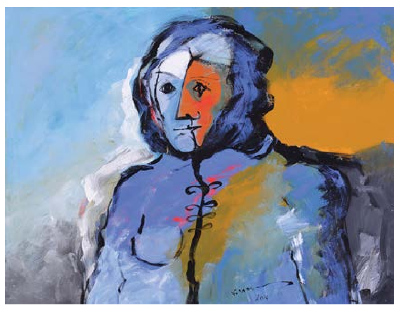
Bilad al-Sawad, 1993. Charcoal on paper, 9 drawings each 65 x 50 cm. Private collection.

First order, associated with the period before modernism, known as pre-In Hosny's work, we see the artist's obsession with creating the codes and modern period, where representation is clearly an artificial place-marker symbols -we can look at them now as simulacra - in repetition that they for the real item. The uniqueness of an artwork, an artifact or an objects turn to become originals, or surpass the original inspiration, if those ever makes it irreproducible, and hence signification seeks this reality. existed in the real world. Baudrillard in this third order thinks that the The second order is linked the age of modernism and the industrial simulacrum precedes the original and the distinction between reality and revolution, where distinctions between representation and reality break representation vanishes. There is only the simulacrum, and originality down due to the proliferation of mass reproduction of copies turning them in Hosny's case here means the inspiration from reality - becomes into commodities. The commodity's ability to imitate reality threatens to totally irrelevant.