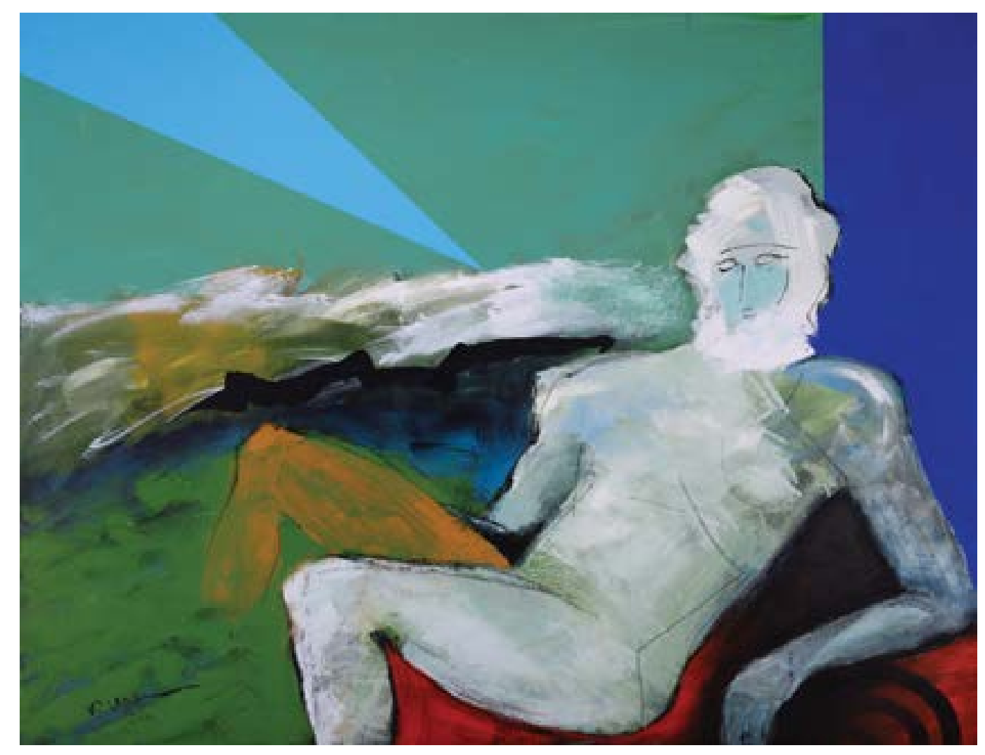
Bilad al-Sawad, 1993. Charcoal on paper, 9 drawings each 65 x 50 cm. Private collection.

with symbols and signs, and that our daily life and human experience is of a simulation of reality<sup>(8)</sup>. Since Hosny's early adoption of the Informel, his early abstractions, signs and symbols found their way on his layered canvases. Brushstrokes, sometimes wild and erratic, other times mathematically and meticulously placed, are loaded with simulations of signs that mimic the coded street messages, from sign boards with significant messaging to seemingly banal graffiti. Those codes may have an original for Hosny, or may not, and he keeps the process of repetition of coding in perseverance over surfaces and over time. For Baudrillard, a simulacrum or simulacra are not always merely mediations of reality. or even deceptive mediations of reality. Hosny's codes are not found in the real, nor are based in a reality, nor do they hide a reality. Those symbols simply hide over and underneath layers of paint, to remind us